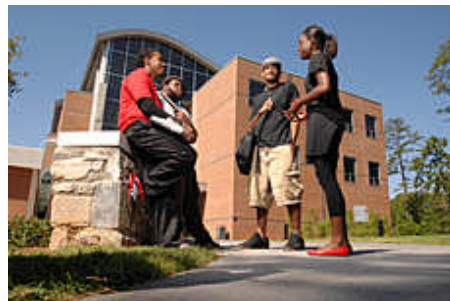
Fill flash is added to be sure the faces of the students are easily seen on a bright sunny day.

They were to turn in their assignments as if they were submitting them to an editor. They needed a cover letter to tell me about what they were submitting. They needed a folder with their selects and another folder with all the images they shot. Each of the photos in the selects needed to have a caption embedded in the IPTC fields. Most editors enjoy being able to send a photo to the designer which already the caption is in the photo.