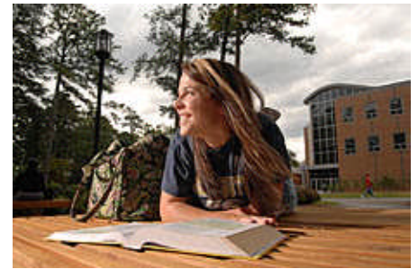
This was made for Clayton State University to use to promote the school. A fill light was added to make the image pop while sky was still gray.

Some students forgot the captions, some forgot the cover letter and yes some were late handing them in. While most had everything done properly we still had some where the captions were lacking the: who; what; where; when; and how parts of the caption.