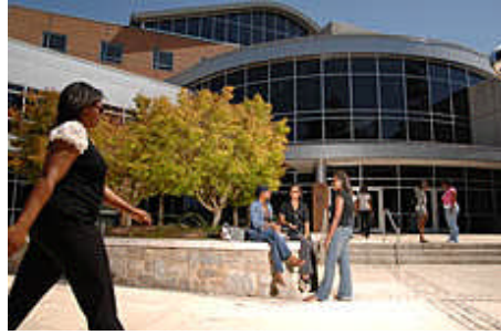
James M. Baker University Center at Clayton State University in Morrow, Georgia.

Volleyball Magazine Wake Forest University Whitfield Academy WireImage Woodward Academy World Council Of Churches World Journalism Institute Yamacraw