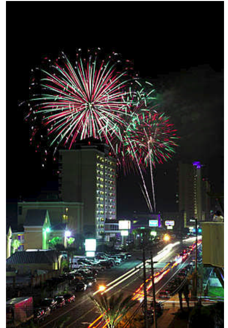
July 4th celebration in Panama City Beach, Florida.

When we think we fit right in and don't stand out from the natives is when it's easy to make some simple mistakes there. (Don't ask for a "to-go" order at a restaurant, it's a "take-away" order.)