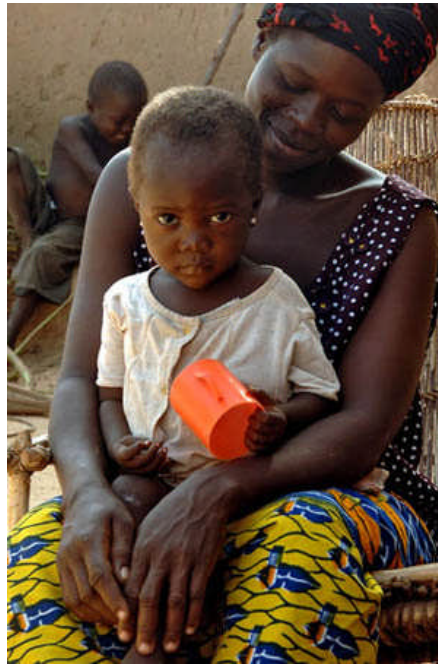
Mother and daughter in Burkina Faso, West Africa.

ABCNews.com Associated Press Athlon Sports Black Star Publishing Boston.com British Broadcasting Company Chiropractic Economics Corporate Legal Times Country Magazine Creative Publishing International Discovery Channel Drug Store News ESPN.com Farm & Ranch Living FederalNewsRadio.com Hollywood Reporter Home Channel News Journal of Accountancy MSNBC.com San Jose Mercury News SFGate.com Sports Illustrated SYNC Magazine The New York Times The Olympian The Washington Times Travel Weekly Magazine Upper Deck US News & World Report Volleyball Magazine Wall Street Journal