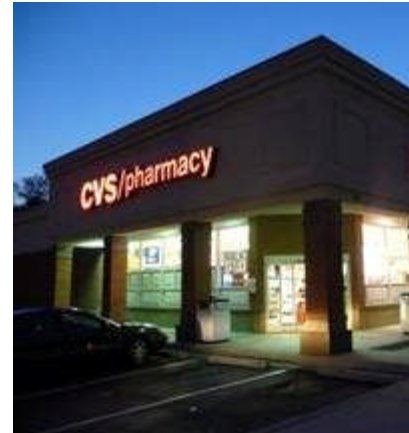
Photo Tip: Take photos right around dusk and dawn of lighted signs and buildings for a more dramatic look.

Many times the still image is more powerful than the moving image simply because it IS still... it "captures the moment." But there