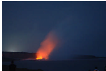
The volcano activity at Holei Pali Lookout is often only visible at night.

Check out the postcards. They can save you time finding the best angle. Looking at the postcards and perhaps asking the locals where they were made puts you on the trail to the most dramatic locations for great photos. Once you find that general area look around, you can probably improve on the post card picture.