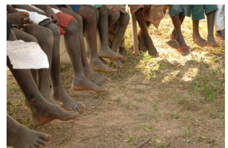
Different angle which highlights the cultural differences of these kids in a class in West Africa.

Use your camera to journal your trip. Photograph the food you eat, where you stay and the people you meet. Some of these "notes" may end up as a large print on your wall.